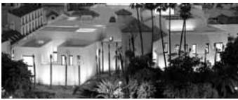
Museo Picasso Malaga

(2007); the Museo Picasso Malaga (2004); the Mori Arts Center (2003); the Georgia O'Keeffe Museum (1997); the renovation of the Whitney Museum of American Art (1995-1998); and The Andy Warhol Museum (1994).