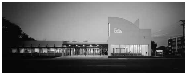
Our Savior Lutheran Church