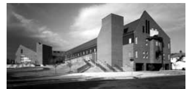
Whittier Community School