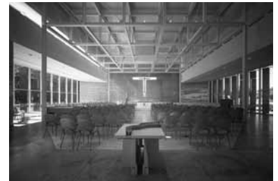
St. Croix Lutheran Chapel