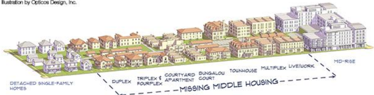
Illustration by Opticos Design, Inc.

If you are interested in exploring leadership opportunities at the local chapter level, please express interest by September 12. Learn more »