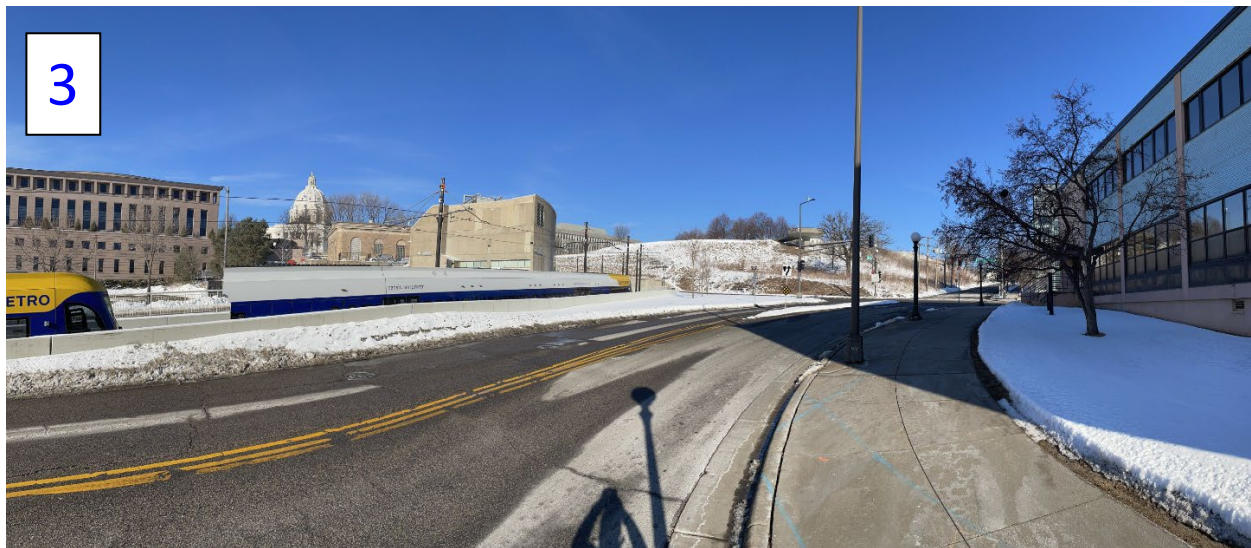
View north from Robert St. N. toward sloped site of Cass Gilbert Memorial Park and concrete overlook.