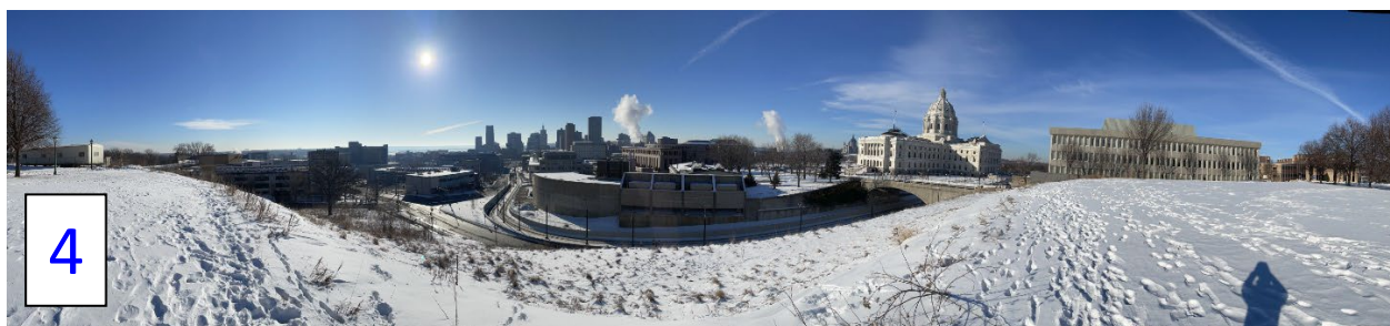
Panorama south from site featuring overlook (left), St. Paul downtown skyline, cathedral, and state capitol. LRT in foreground.