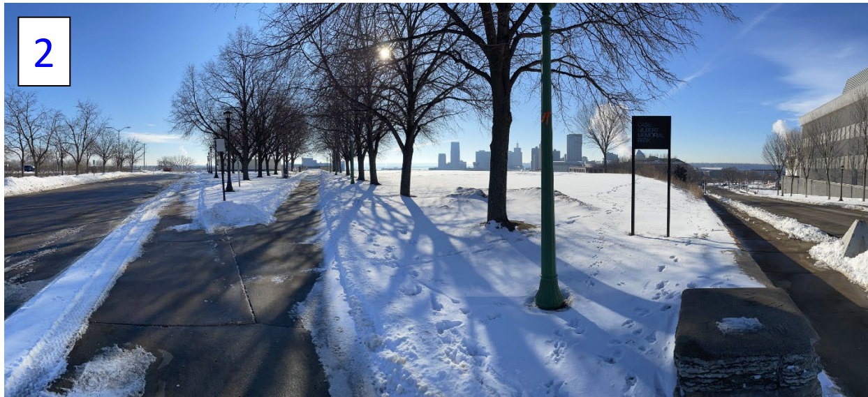
Panorama southeast from corner of Sherburne Ave. and Cedar St. toward St. Paul skyline and tree-lined allée (right).