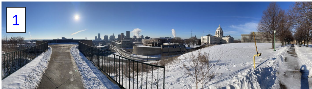
Panorama south from site featuring overlook (left), St. Paul skyline and state capitol (center), and tree-lined allée (right).