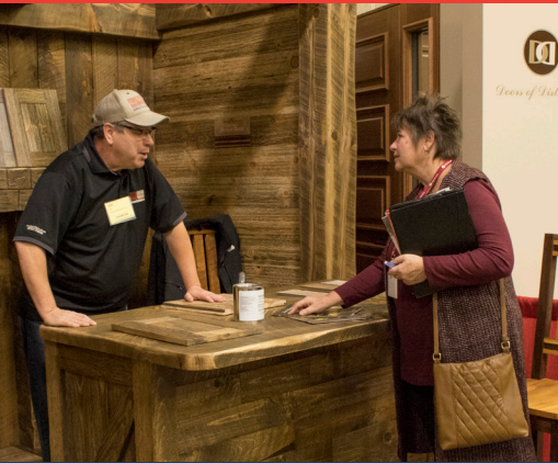
EXHIBIT HALL SCHEDULE*