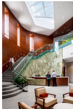
Mayo Clinic Dan Abraham Healthy Living Center Expansion Rochester, Minn.