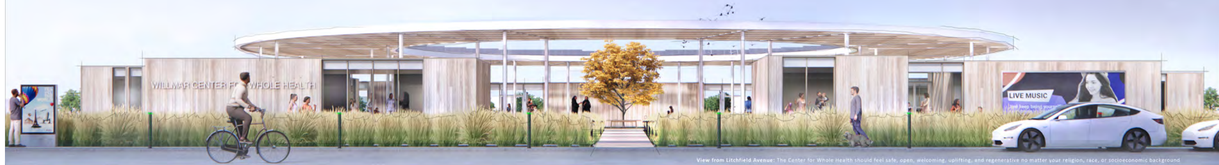
View from Litchfield Avenue: The Center for Whole Health should feel safe, open, welcoming, uplifting, and regenerative no matter your religion, race, or socioeconomic background.