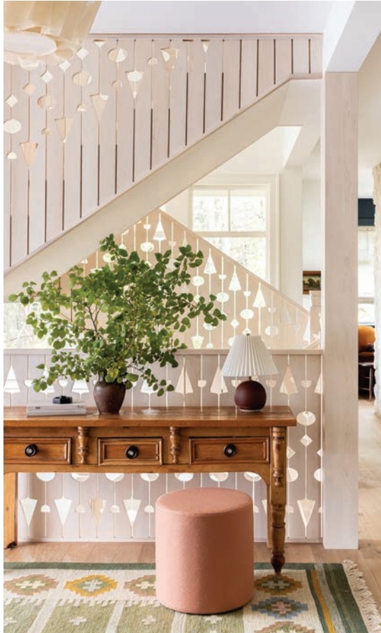
See page 28 for home details.

AIA Minnesota is pleased to present a look book featuring architect-designed homes throughout the Midwest region that showcase the innovation and skill of Minnesota architects. The projects on the following pages were each submitted for the 2022 Home of the Month program, a 20-year collaboration between AIA Minnesota and the Star Tribune that highlights a different architect-designed home each month in the Sunday Homes & Gardens section.