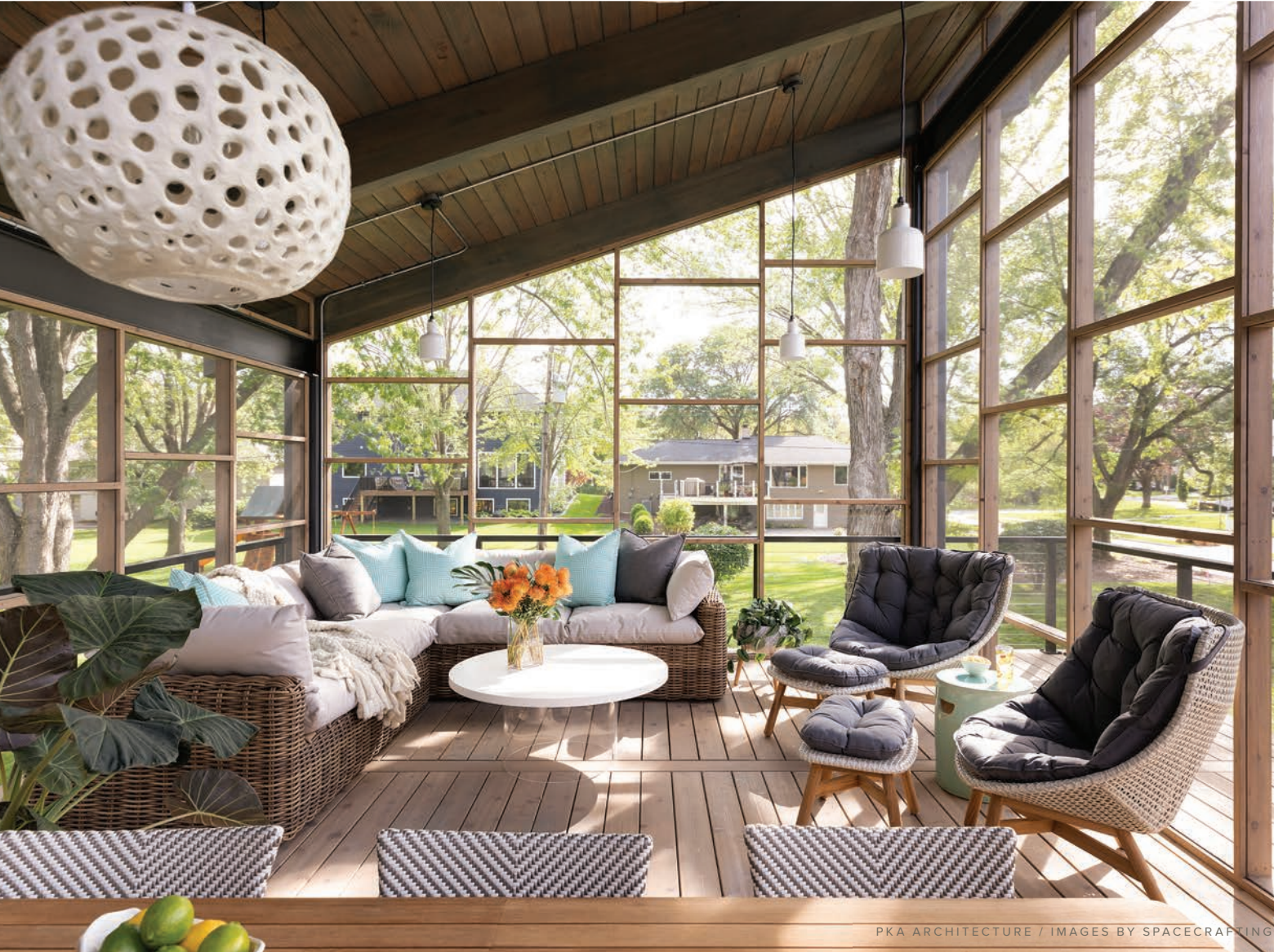
PKA ARCHITECTURE / IMAGES BY SPACECRAFTING