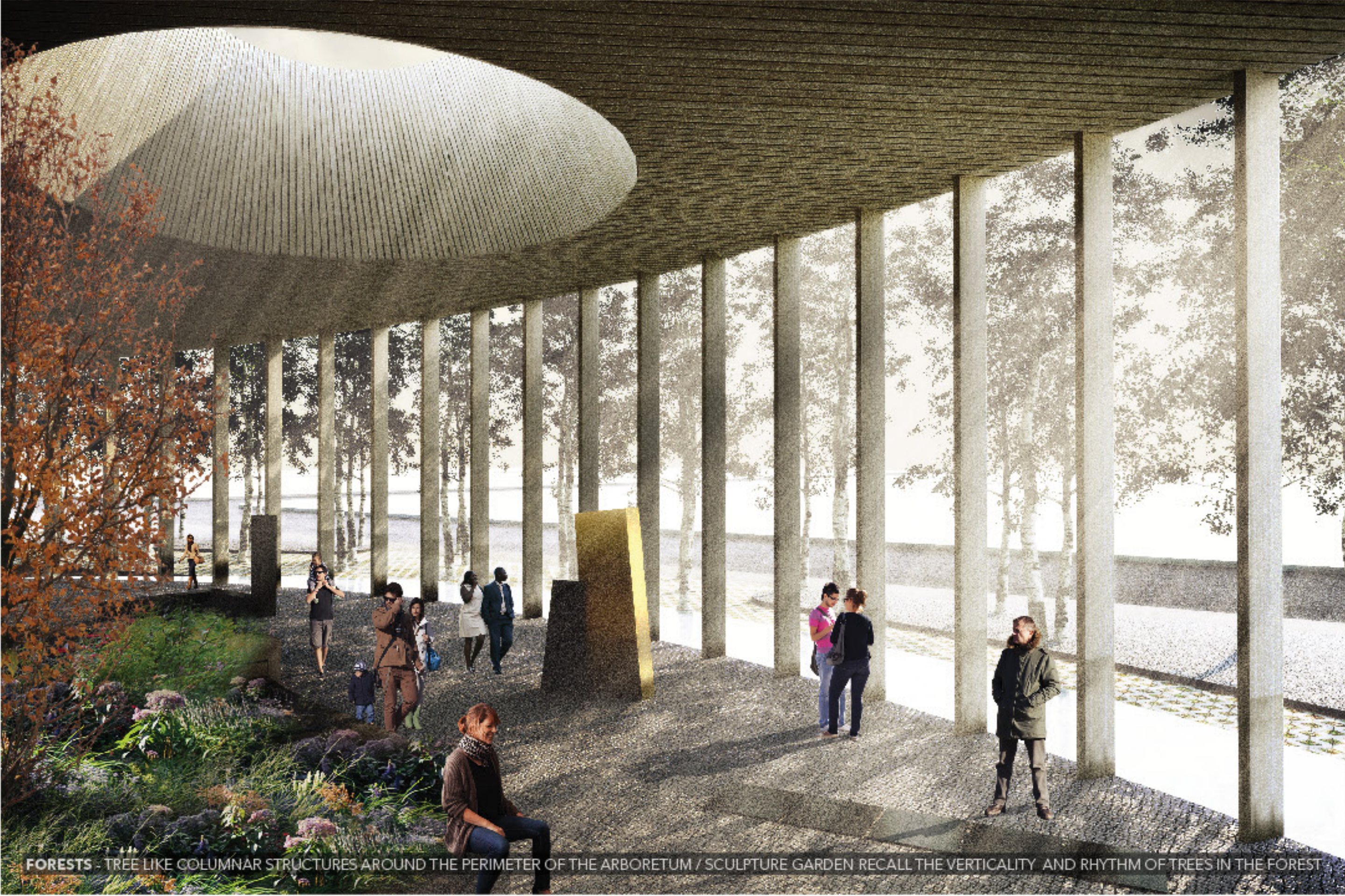
FORESTS - TREE LIKE COLUMNAR STRUCTURES AROUND THE PERIMETER OF THE ARBORETUM / SCULPTURE GARDEN RECALL THE VERTICALITY, AND RHYTHM OF TREES IN THE FOREST.