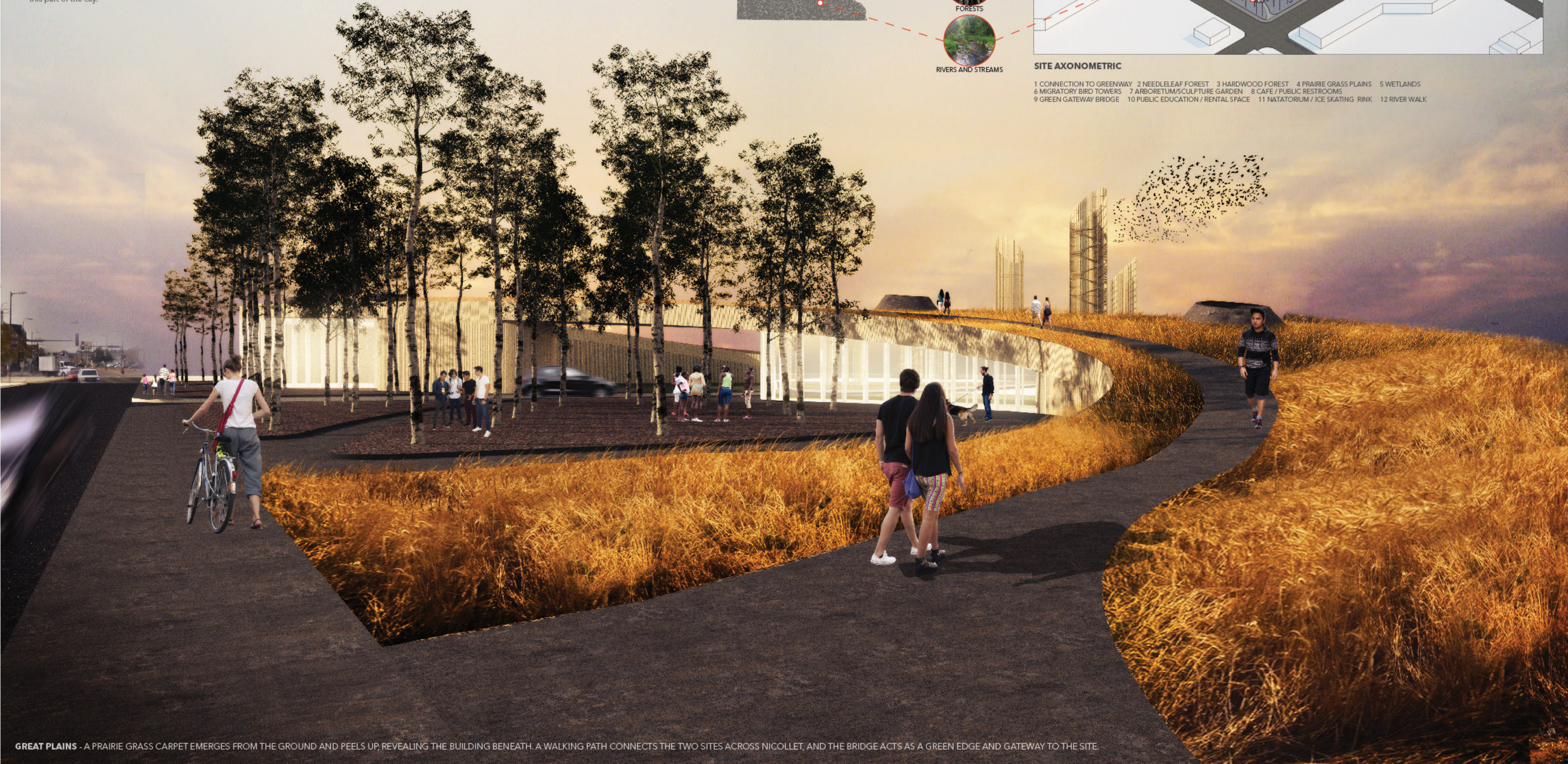
GREAT PLAINS - A PRAIRIE GRASS CARPET EMERGES FROM THE GROUND AND PEELS UP, REVEALING THE BUILDING BENEATH. A WALKING PATH CONNECTS THE TWO SITES ACROSS NICOLLET, AND THE BRIDGE ACTS AS A GREEN EDGE AND GATEWAY TO THE SITE.