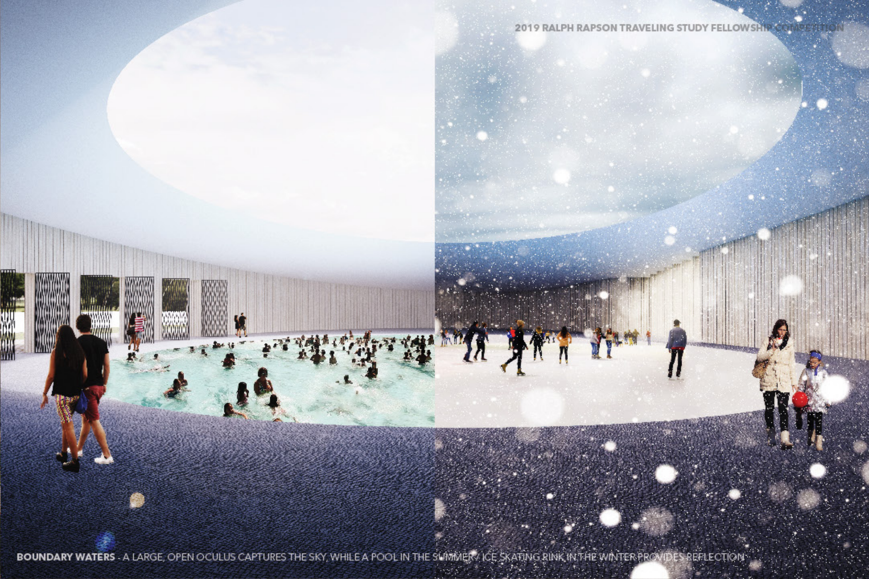
BOUNDARY WATERS - A LARGE, OPEN OCULUS CAPTURES THE SKY, WHILE A POOL IN THE SUMMER, ICE SKATING RINK IN THE WINTER, PROVIDES REFLECTION.