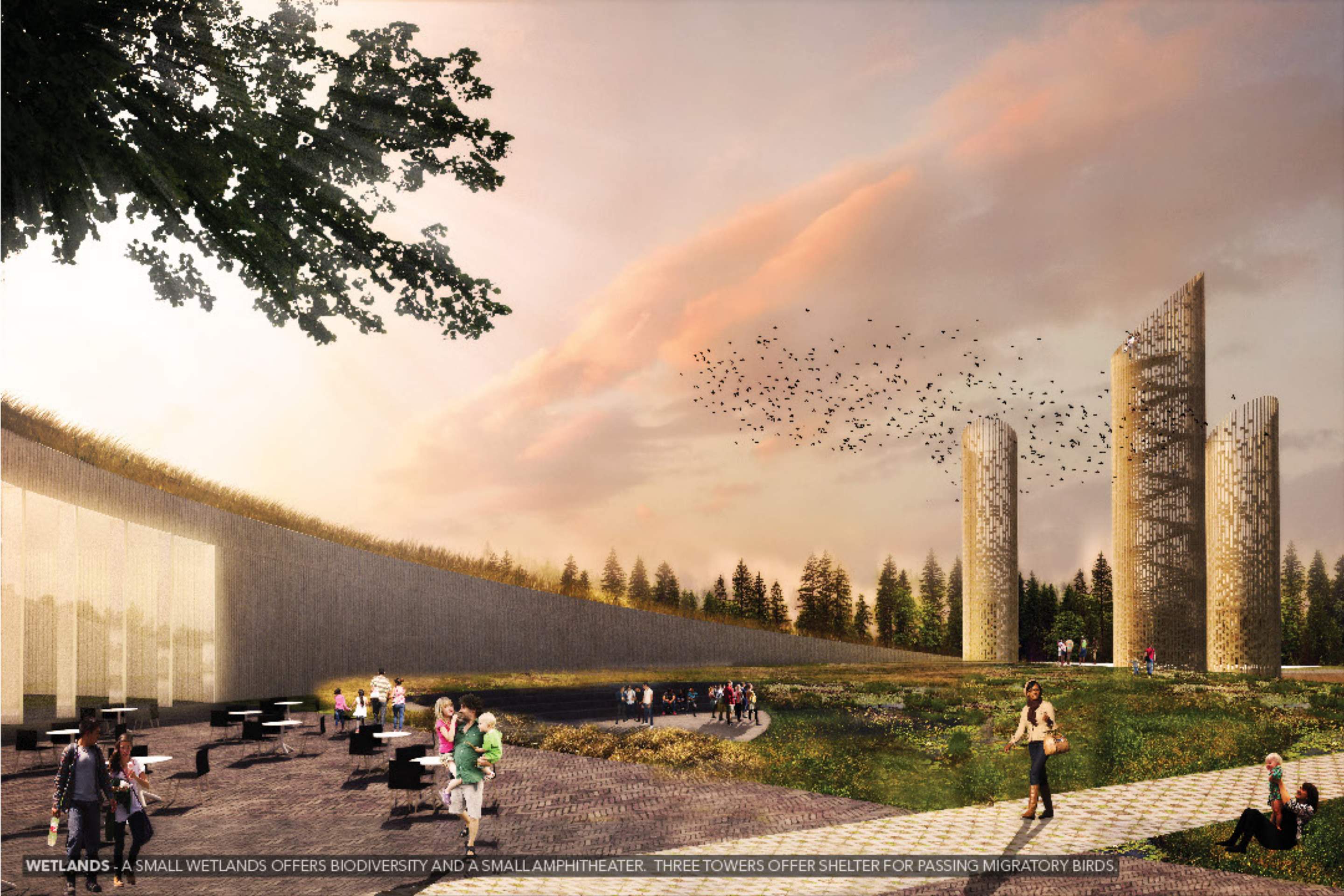
WETLANDS - A SMALL WETLANDS OFFERS BIODIVERSITY AND A SMALL AMPHITHEATER. THREE TOWERS OFFER SHELTER FOR PASSING MIGRATORY BIRDS.