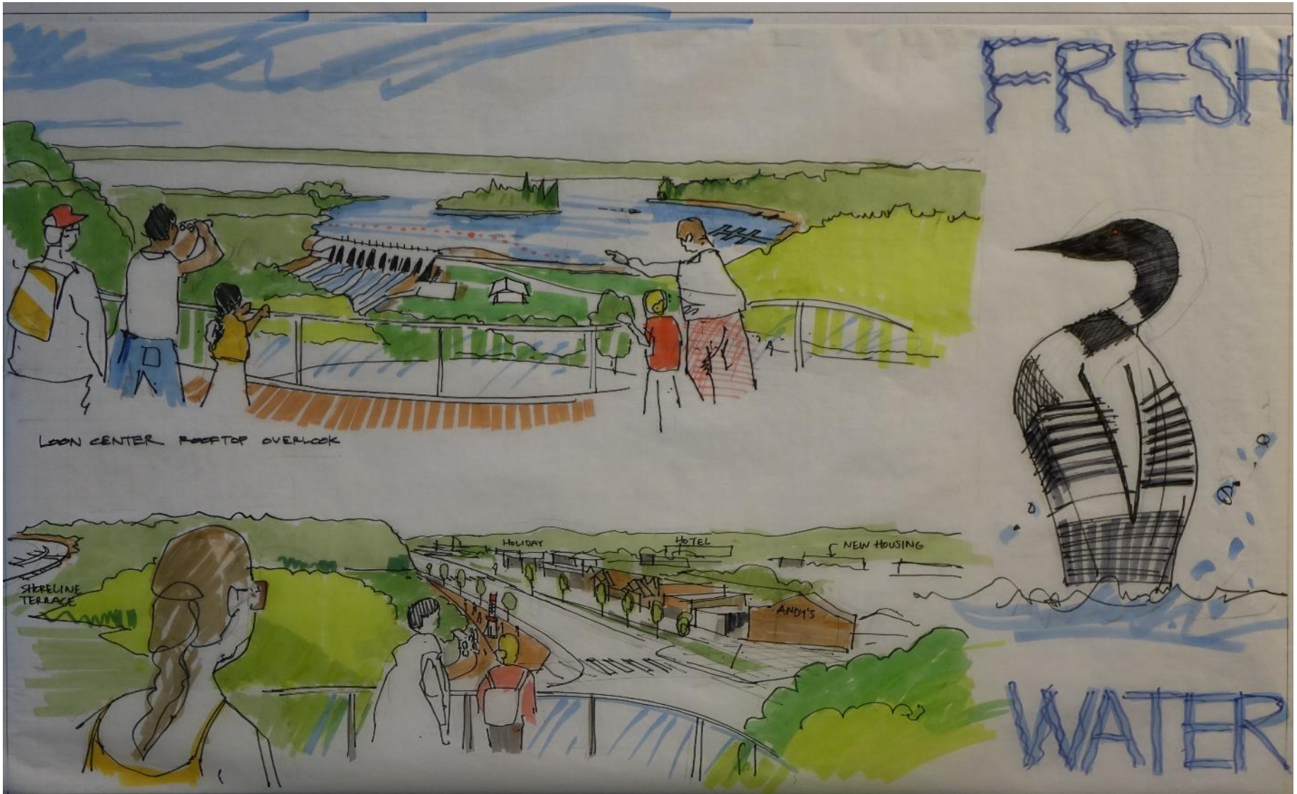
LOON CENTER ROOFTOP OVERLOOK