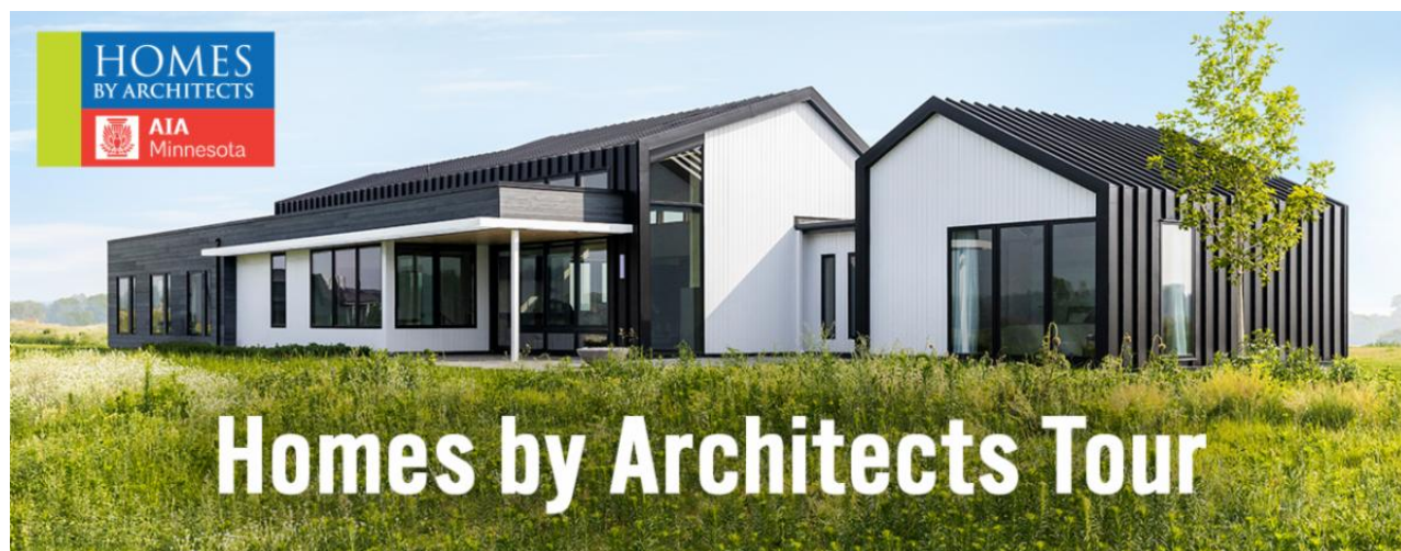
Photo: Home #13 "Valdres at White Oaks Savanna," designed by Christopher Strom Architects.

Does your firm support young professionals? The EP Friendly Firm Award program is now accepting submissions from firms who demonstrate a commitment to supporting early career professionals. Learn more and apply for the award »