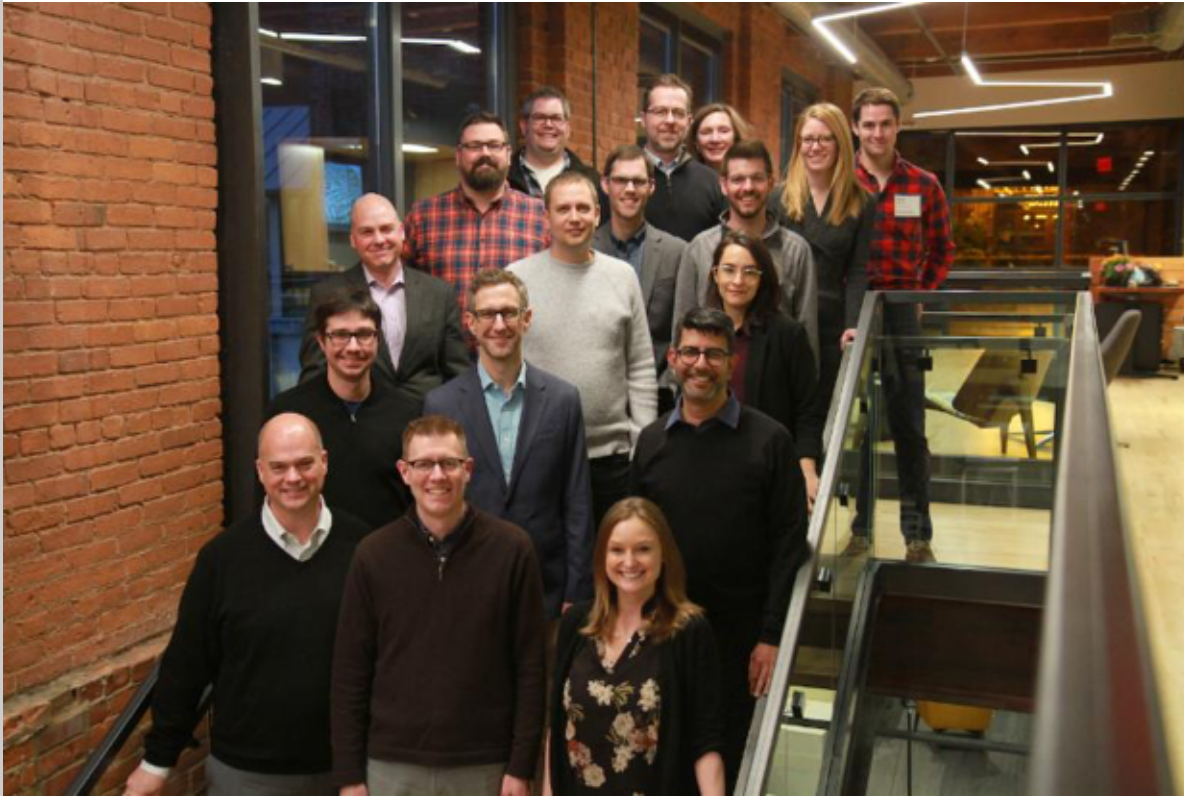
Above: 2019 Leadership Forum Participants