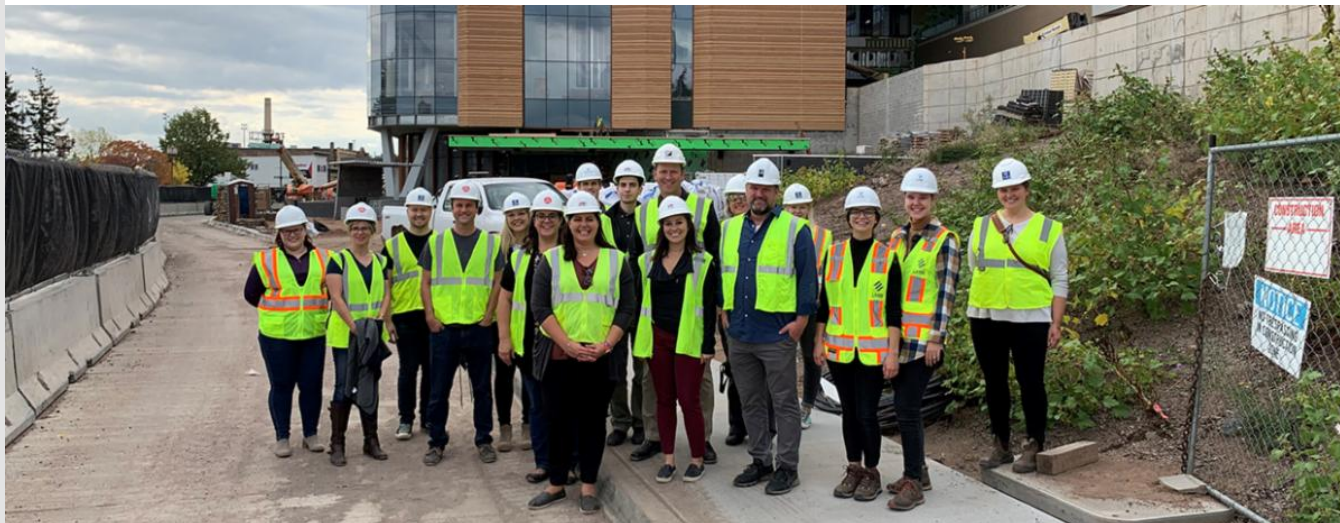
Photo: In early October, AIA Northern Minnesota hosted a hard-hat tour at a local healthcare facility under construction.