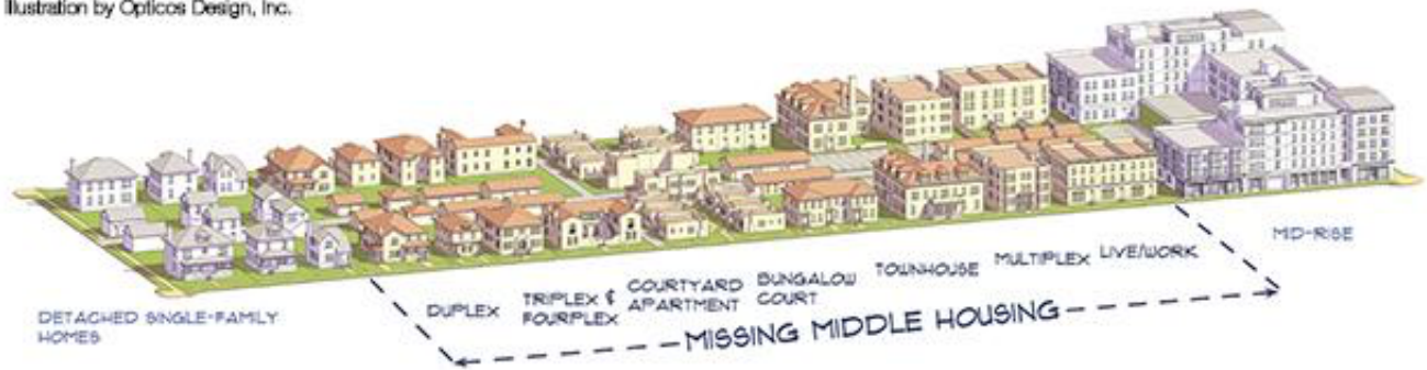
Illustration by Opticos Design, Inc.