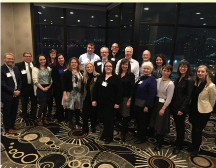
Pictured above: AIA North Central States Region Leaders at the 2016 Grassroots Conference.