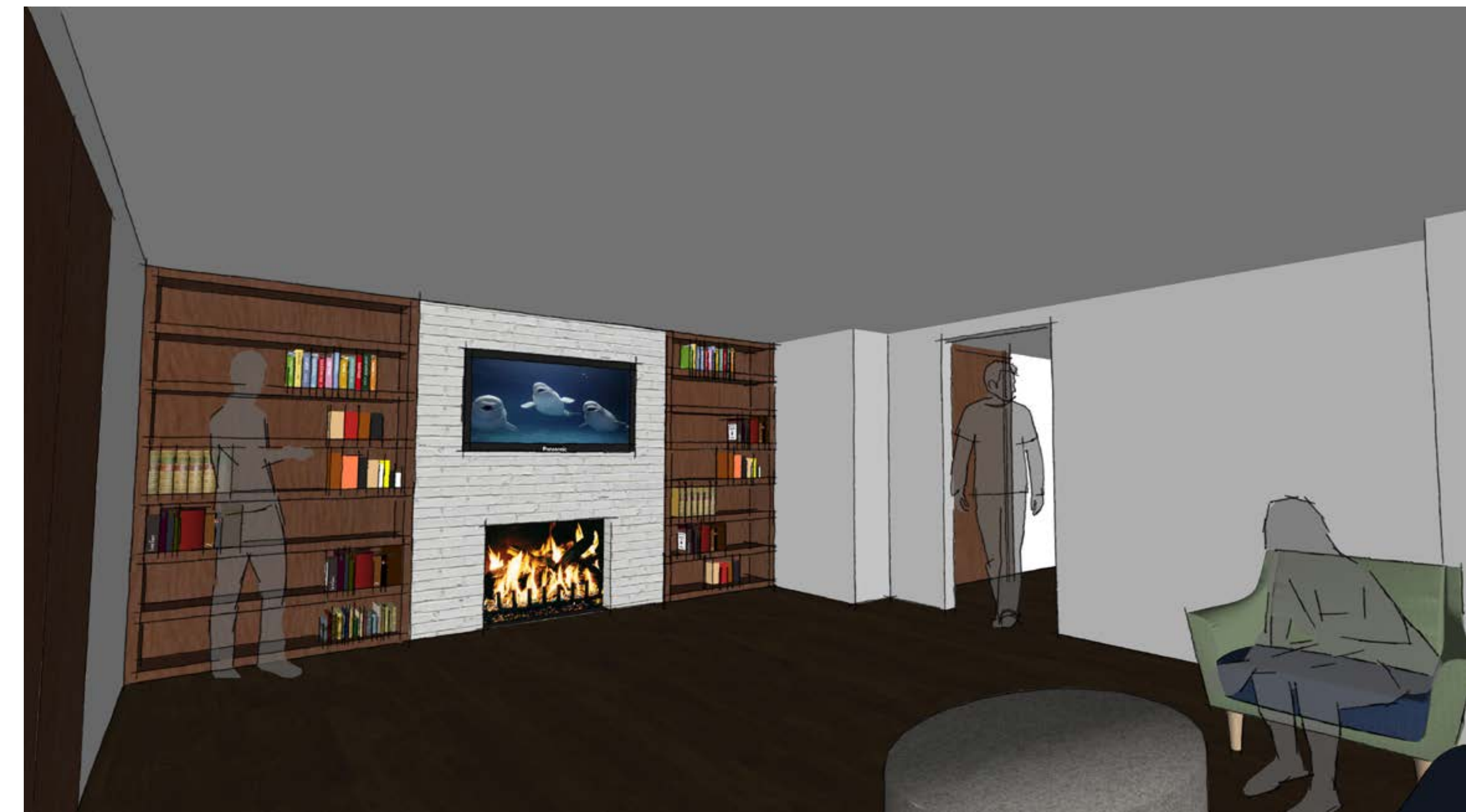
FIRST FLOOR COMMON ROOM