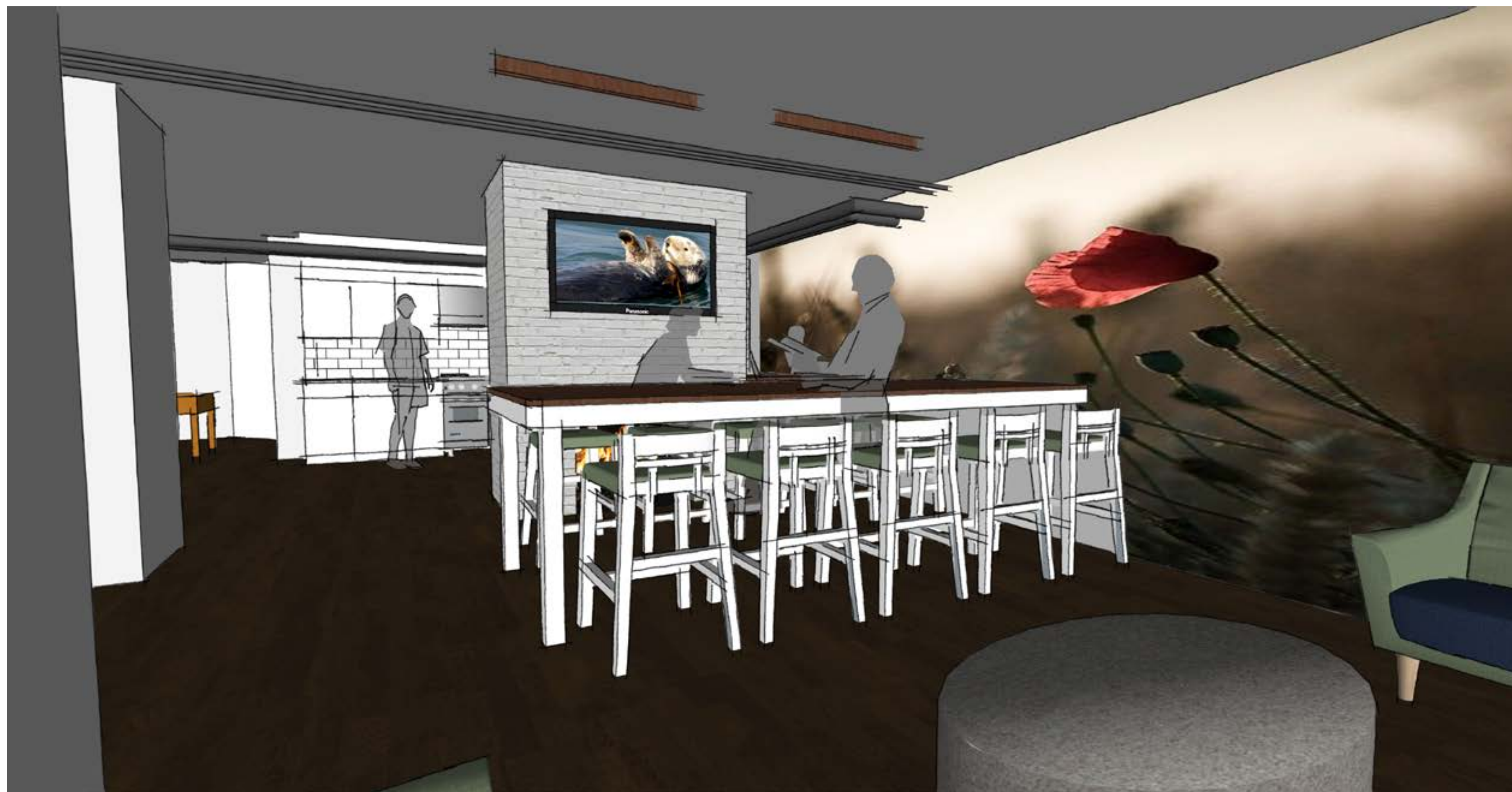
VIEW FROM LOUNGE AREA