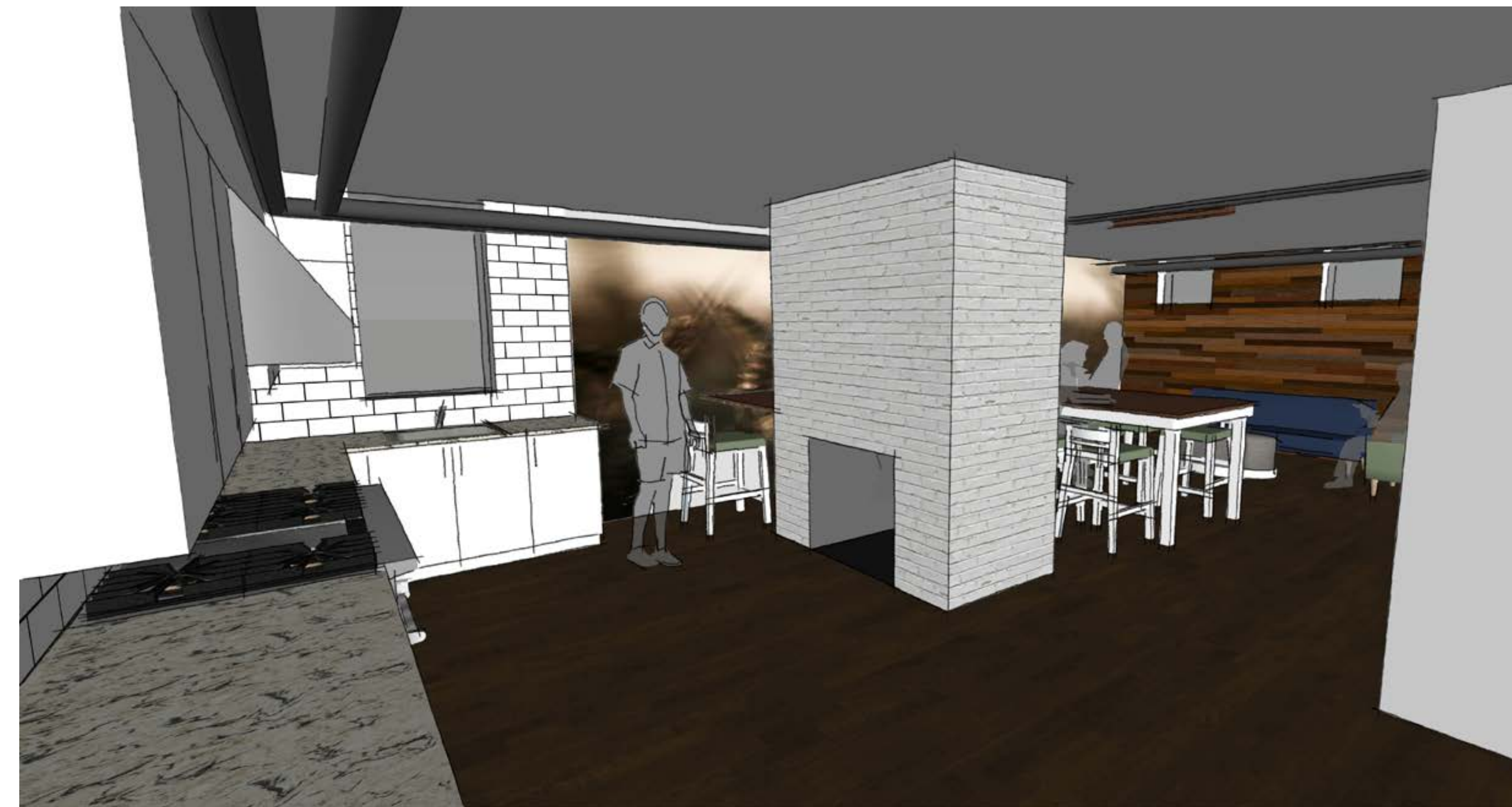
REVISED KITCHEN LAYOUT