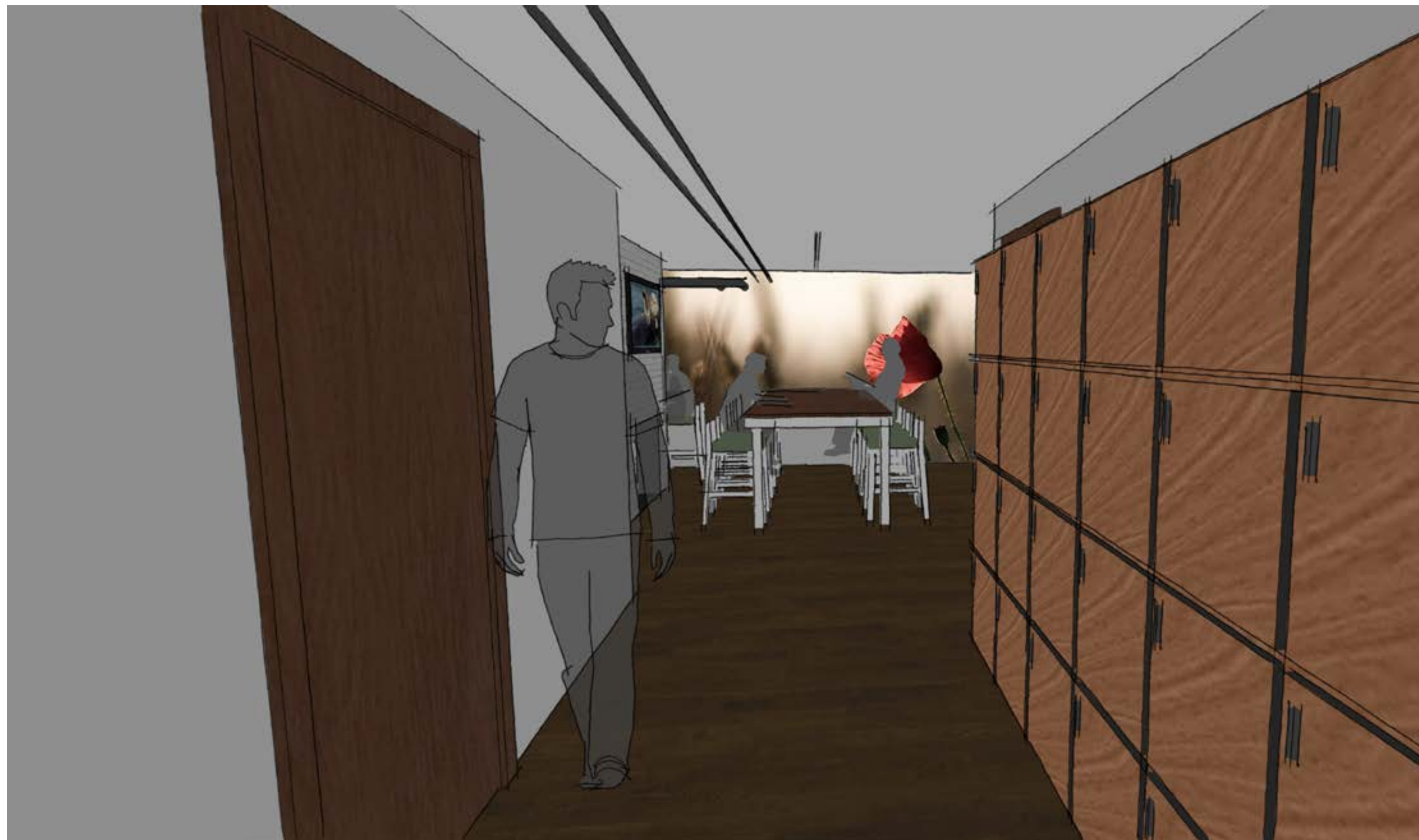
VIEW FROM BOTTOM OF STAIR